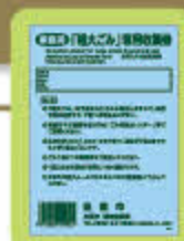
Bulky Waste Collection Seal

Bulky Waste collection requires an application and advance reservation.