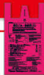
Landfill Waste Bag

You may dispose of 4 things at once , including both bags of waste and items with collection tickets.