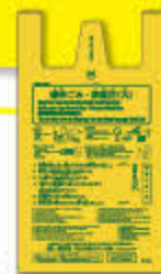
Shredded Waste Bag

Dispose of shredded waste items by inserting them into a designated Shredded Waste Bag (yellow).