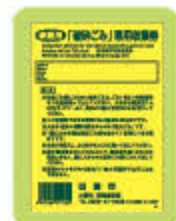
Shredded Waste Collection Seal

Depth (m) + Width (m) + Height (m) = 2 m or less