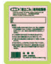
Landfill Waste Collection Seal

Depth (m) + Width (m) + Height (m) = 2 m or less